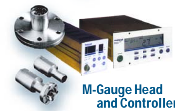
M-Gauge Head and Controller

Precise Vacuum Gauges from Canon Anelva Technix